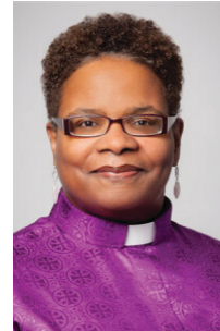
Bishop LaTrelle Easterling